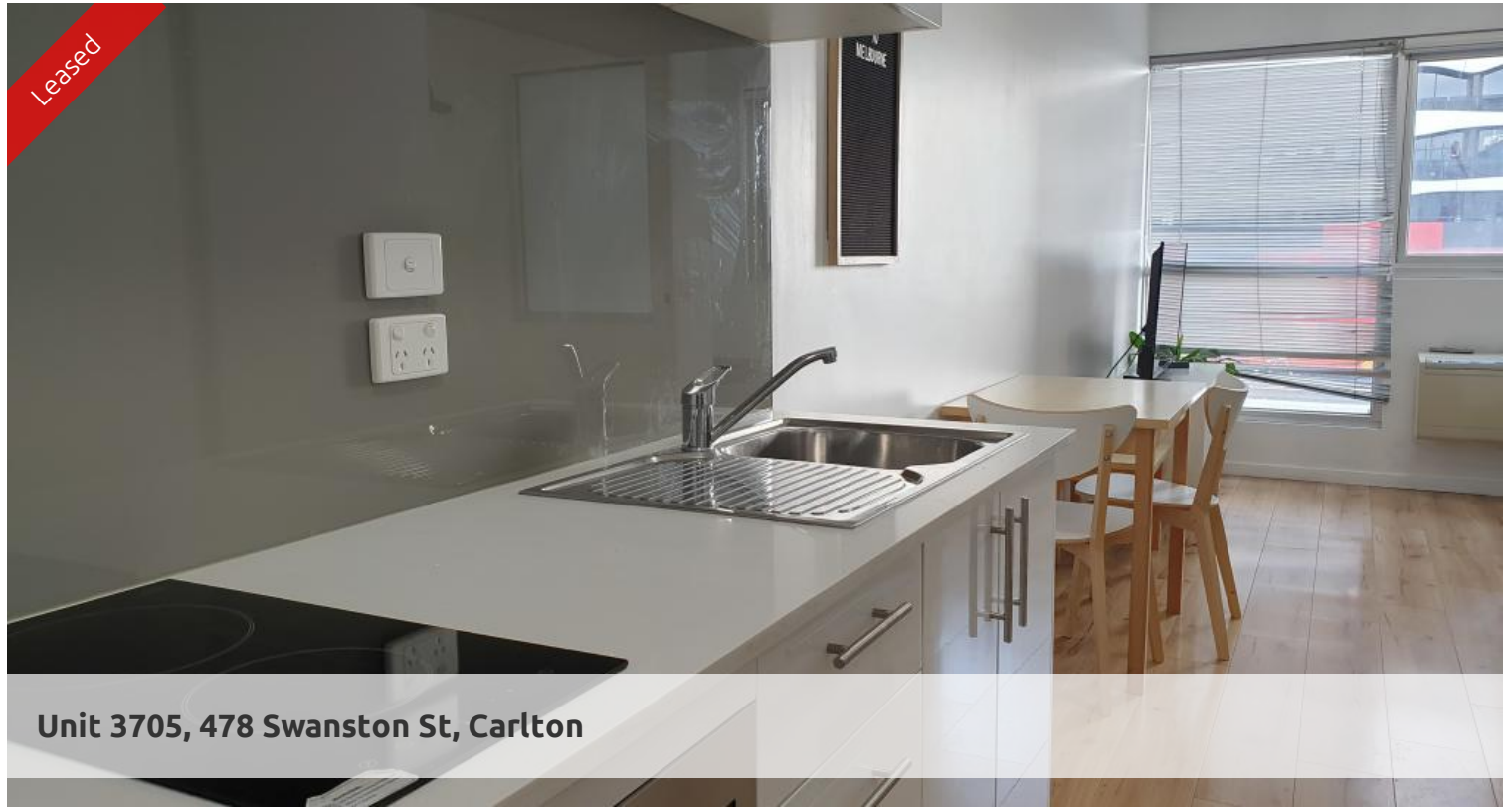
Unit 3705, 478 Swanston St, Carlton