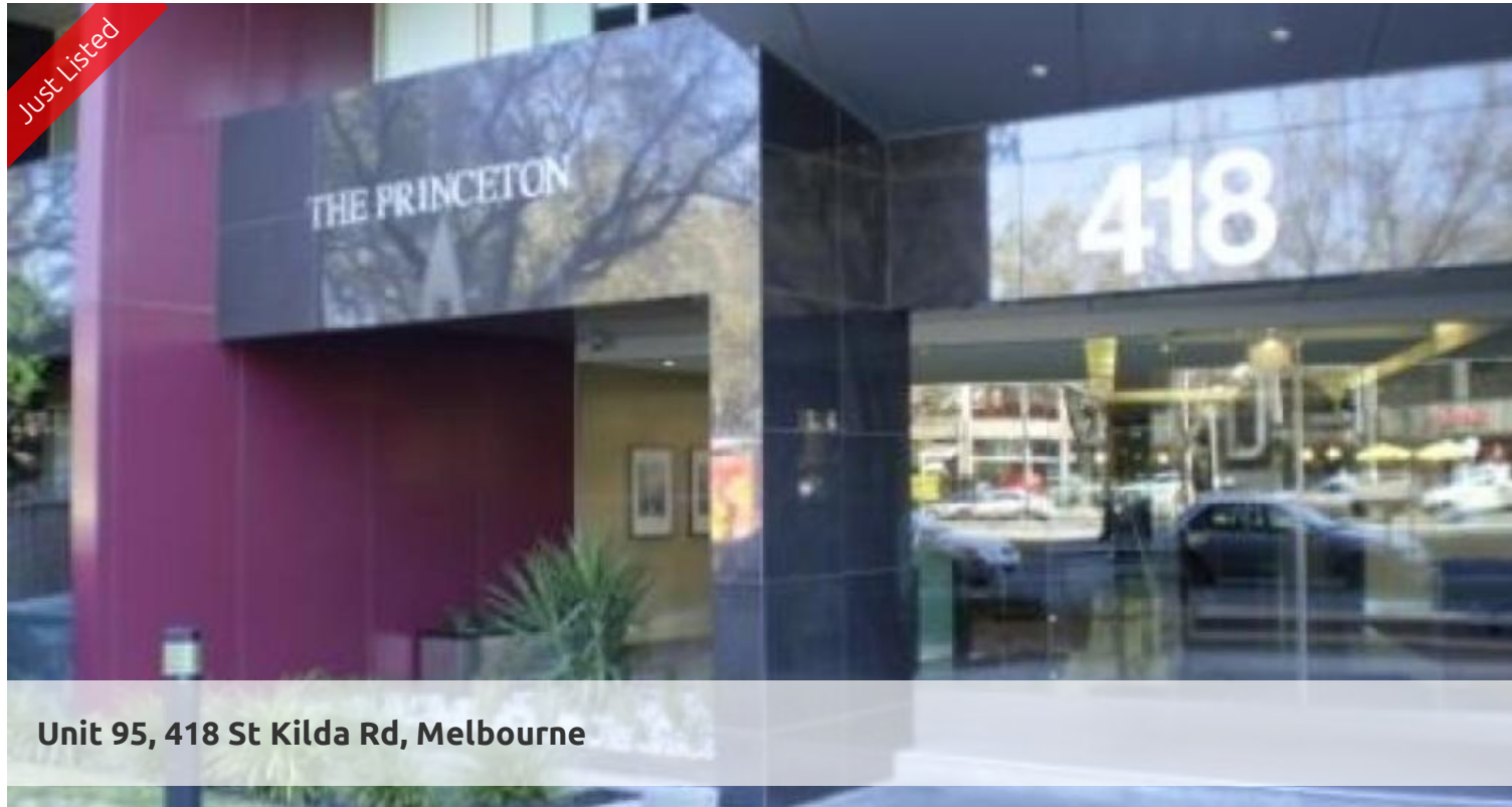
Unit 95, 418 St Kilda Rd, Melbourne