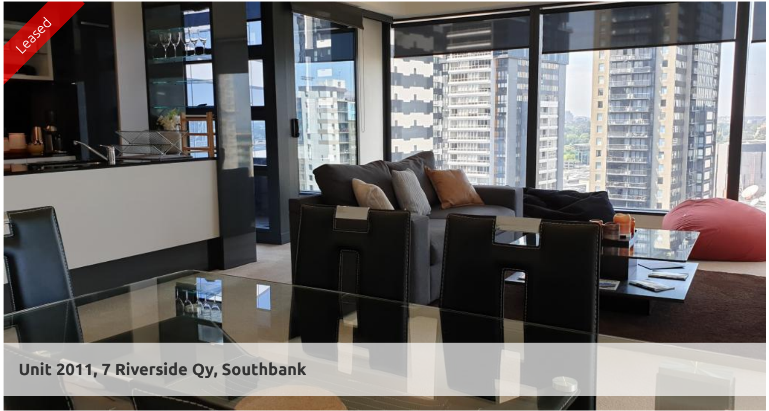
Unit 2011, 7 Riverside Qy, Southbank