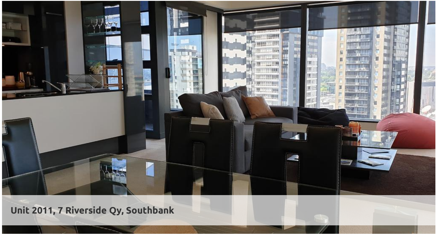
Unit 2011, 7 Riverside Qy, Southbank