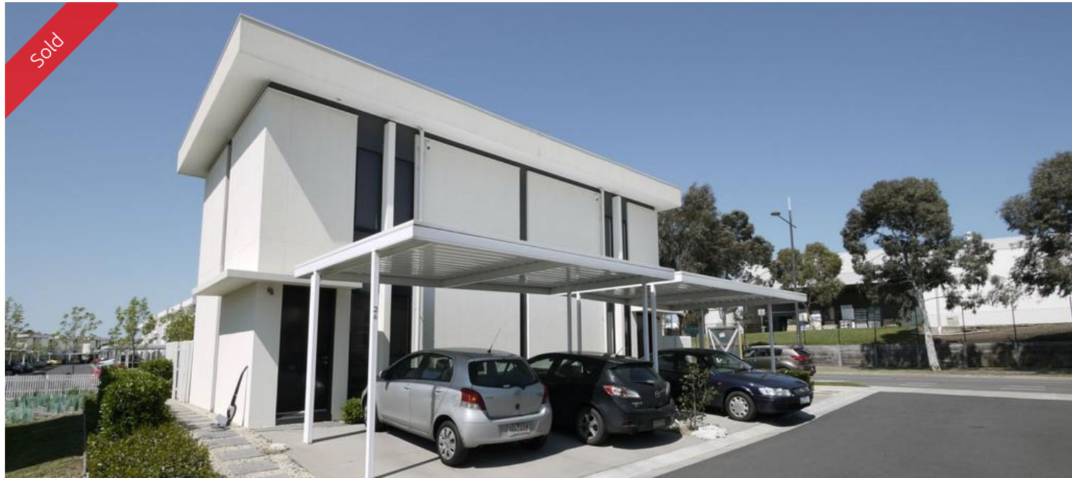
Unit 48, 80 Enterprise Dr, Bundoora