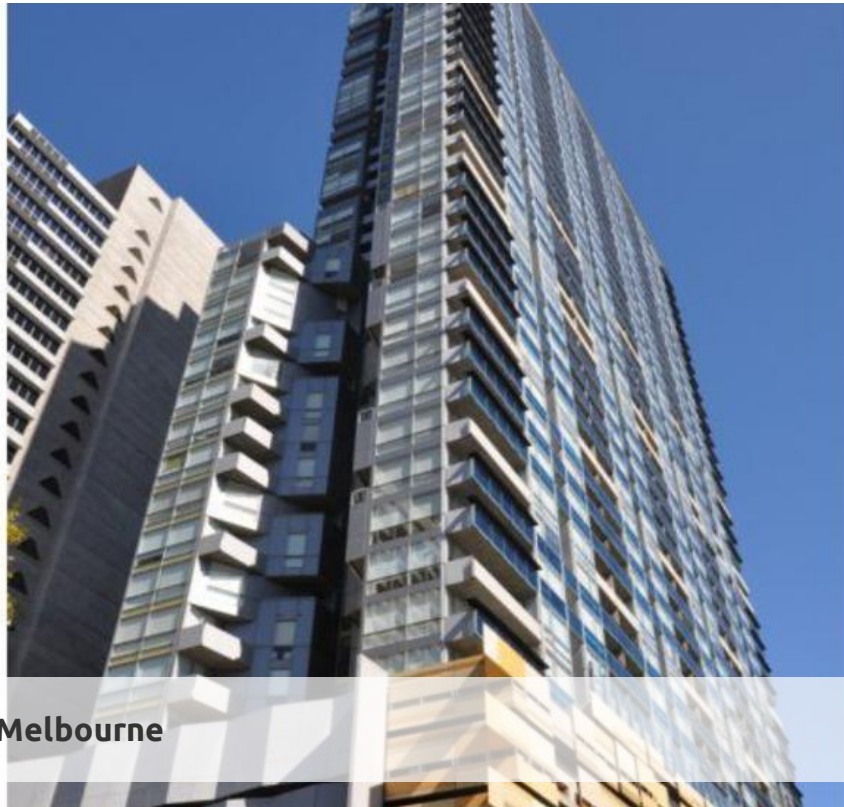
22 Jane Bell Lane, Melbourne